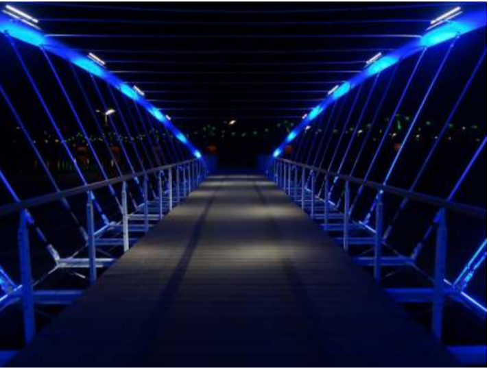
Residents and tourists are attracted by the Lovers' Bridge, which stretches over the Zgłowi czka River, right at the mouth of the Vistula. Come with your sweetheart and bring a commemorative padlock with your initials.

The most famous artifact exhibited in the Włocławek History Museum, and at the same time a magnet attracting tourists to Włocławek, is undoubtedly the early medieval sword from the so-called northern cultural circle, dated to the 9th-10th century, which was found in 2024 during the deepening of the port basin of the Jerzy Boja czyk Water Port at 1a Piwna Street. The richly decorated artifact, dated to the 9th-10th century, was initially attributed to the Vikings, who, as is known, appeared on the Vistula. However, experts reserve that determining the origin of this incredible treasure, as well as the circumstances in which this unique weapon ended up in the castle on the Vistula will be extremely difficult. The sword underwent conservation work immediately after being found and quickly returned to Włocławek. Currently, it is an important part of the museum exhibition of the Włocławek History Museum and attracts crowds of residents and tourists every day.