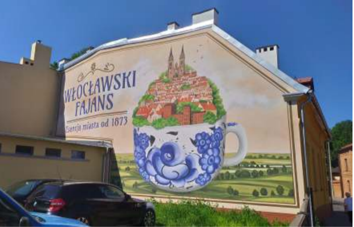
The downtown murals refer to the past of Włocławek and historical places, motifs, events and figures important to the local community.

Walking around the centre of Włocławek, you will certainly notice many valuable examples of architecture, both sacral and secular. The most important temple and the most valuable monument is the Cathedral of the Assumption of the Blessed Virgin Mary, recognized by the regulation of the Republic of Poland - a Monument of History. This is an amazing place filled with history, monuments and art, a witness to many important events for the city and Poland, a unique facility for residents and tourists. Also noteworthy is the Franciscan monastery, St. John's Church, the Evangelical church, and the bell tower located right next to the cathedral basilica. In the city's architecture, walkers and tourists will encounter many architectural styles, from Art Nouveau to modernism. We strongly encourage you to pay attention to the many impressive buildings, some of which have been renovated in recent years. We encourage you to pay attention to architectural details, especially on the facades of historic buildings, which