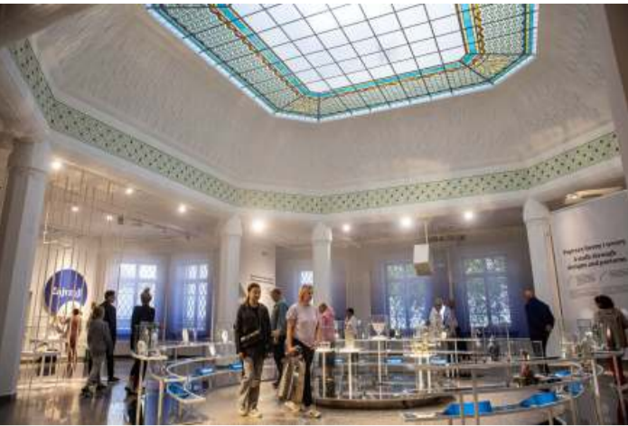
The Interactive Faience Centre - Faience Treasury, which is very popular among residents and tourists, is located in a renovated building complex: the former bank headquarters from 1911 (pictured above) and a contemporary building from 1993.

One of the advantages of Włocławek is its location on the Vistula River. Come to the Marshal Józef Piłsudski Boulevards and enjoy your rest surrounded by greenery with a wonderful view of Zawile, a district of Włocławek located on the right bank of the Vistula. Through the Lovers' Bridge (over Zgłowi czka River) you will reach the Jerzy Boja czyk marina with a very interesting sail shape and the parks over Zgłowi czka - the Henryk Sienkiewicz City Park, Park na Pompce and Park Słodowo -