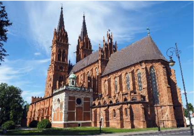
The pearl of the oldest part of Włocławek is the neo-Gothic Cathedral of the Blessed Virgin Mary. This is an amazing place filled with history, monuments and art, a witness to many important events for the city and Poland.

The place from which we recommend starting a walk around the oldest district of Włocławek is the Tourist Information Centre in Włocławek, which operates at 65 Okrzei Street (the Train station building). Here, anyone interested will obtain information on the tourist offer of the city and region, attractions, monuments, recreational places and a list of recommended accommodation and catering points. The Information Centre also offers interesting gadgets related to Włocławek and Kujawy Region, which will certainly be useful when visiting Włocławek. We warmly encourage you to visit this place!